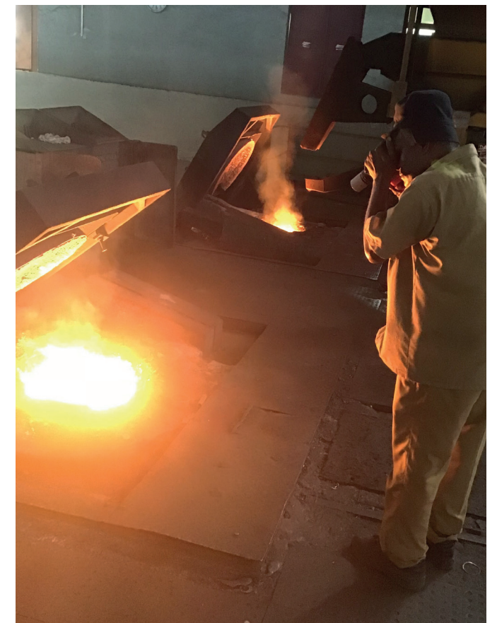
Measurement taken at the furnace location.

The ergonomically friendly equipment is designed for single-hand operation, with contact-free measurement for better safety and easier use in hazardous environments.