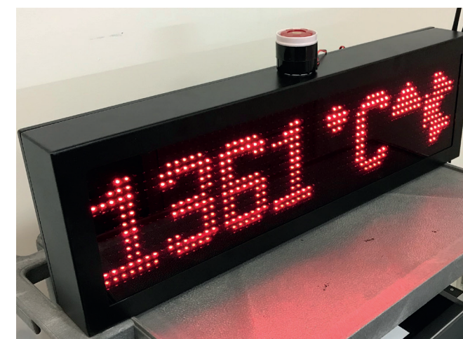
Bluetooth® Jumbo Display