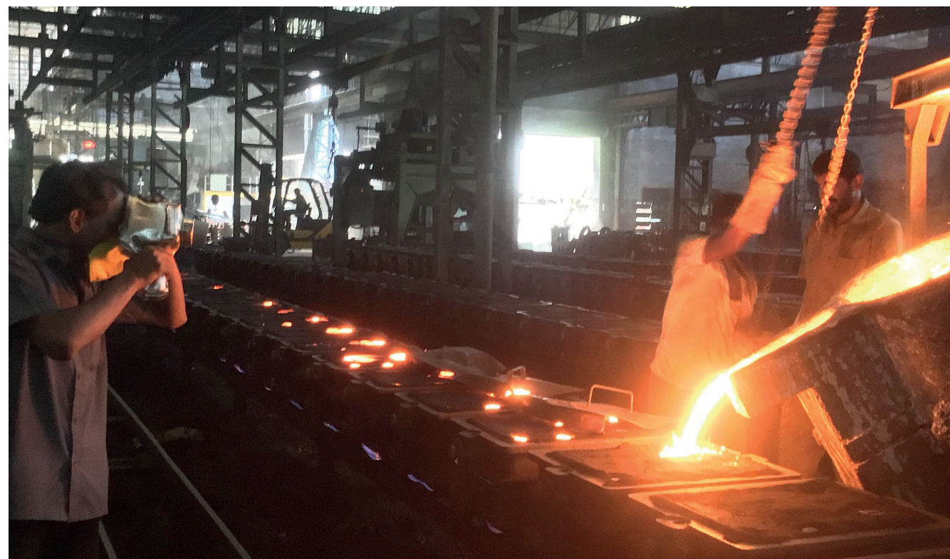
Measurement taken while pouring liquid metal into the moulds - Manual Pouring Lines.